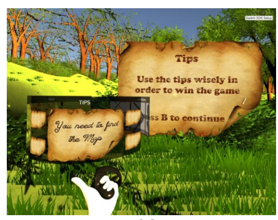
Beginning of the game

Now the tutorial is finished, and the game begins. You can walk around the jungle, collect items for the inventory, and solve how to find the treasure.