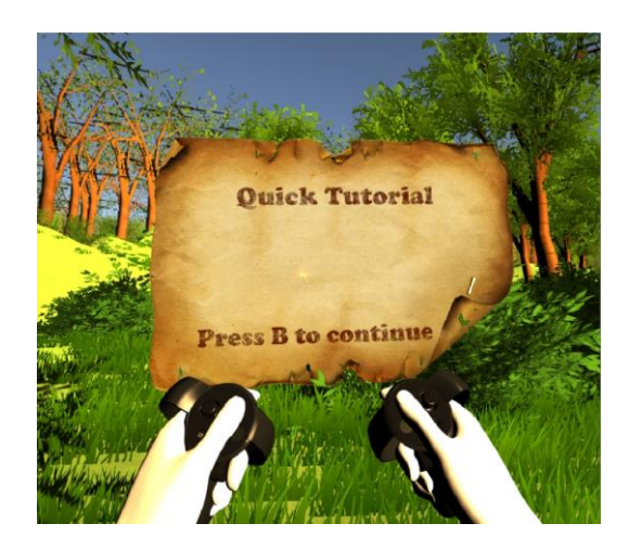
Start here! This is the starting point of the game. There is a tutorial to start the game which explains how to operate the menu: